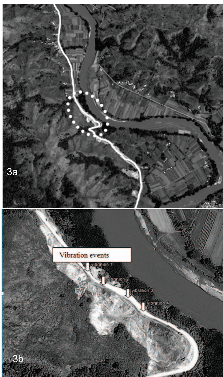
Fig. 3a. Aerial image of the truck transport route taken down the Sigatoka valley road highlighting the Vulo road works (VRW) where the largest number of high intensity vibration events was recorded (see Table 3).

b n=3, data sets are too small to statistically analyse, but are included to highlight the need for further work.