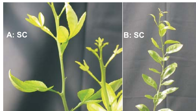
Fig. 3. Young 'Swingle' citrumelo [A (SC)] and 'Cleopatra' mandarin [B (CM)] leaves showing interveinal chlorosis and leaflet (A) or leaf (B) cupping for the 2.00 mg L -1 Cu treatment (the highest Cu treatment) at harvest 137 days after transplant (108 days after initiating Cu treatment).

A comparative study of six citrus rootstock seedlings to increasing levels of rhizosphere Cu [CuEDTA (0.05 to 2.00 mg L -1 )] in sand culture at pH 5.86 was conducted for a period of 108 days. The study supports work by others that citrus rootstocks disproportionately accumulate more Cu in roots than in leaves, and that they differ in translocation of Cu from roots to leaves. Other nutrients analyzed (Ca, K, P, Fe, Mn, and Zn) also accumulated in roots more than in leaves. The exception was Mg which