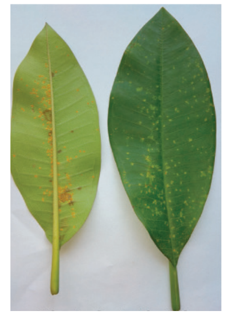
Fig. 2. Orangish rust pustules on abaxial surface and corresponding yellowish spots on adaxial surface of affected leaves

these pustules coalesced and covered entire leaf causing inward rolling of leaves, necrosis, senescence and severely affected leaves fell off by leaving the tree with bare branches (Fig. 3).