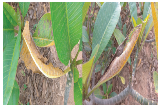
Fig. 3.1. Severe infection leads to inward rolling, necrosis and senescence of affected leaves

Further, molecular identity of this pathogen was confirmed by