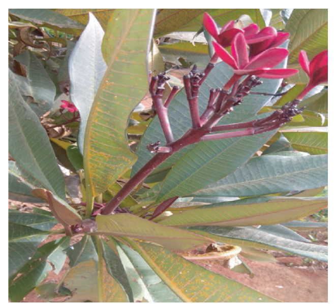
Fig. 1. General view of rust symptoms on Plumeria rubra

Rust of temple tree caused by C. plumeriae was noticed during 2016-17 and the disease was seen in June, July and till the end of August. But the disease severity varied from 80-100 per cent and similar disease severity was observed during 2017-18. Fig. 1 shows symptoms of the disease on P. rubra . Initially, numerous orange coloured rusty pustules on the lower surface and corresponding yellowing on the upper surface of the affected leaves was observed (Fig. 2). With the advancement of disease,