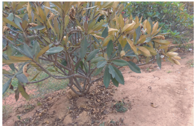
Fig. 3.2. Defoliation of affected leaves can be seen at the base of the plant